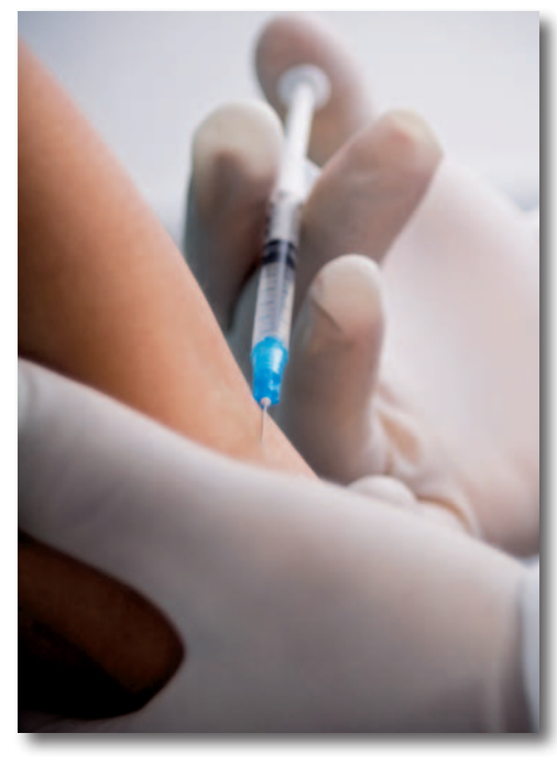
Usual, Reasonable and Customary (UCR) rate. Benefits for non-CDC recommended immunizations for

If you use a network provider, the Fund provides full coverage for immunizations recommended by the Centers for Disease Control and Prevention (CDC) for eligible dependent children and adolescents through age 23. If you use a non-Network Provider, the Fund pays the