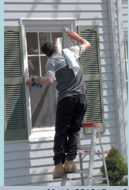
March 2010 | Page 9

he Health and Welfare Fund does not cover participants or their eligible dependents for illnesses or injuries that arise as a result of performing noncovered employment for wage or profit. Any time such service is rendered for wage or profit, there are no benefits (i.e. medical, short-term disability, etc.) payable by the Fund. Non-covered employment means any employment for which contributions are not made to the Fund. Unfortunately, in the past, there have been cases where an individual was performing odd jobs, i.e. painting, roofing, etc. for which they received payment. The individual was injured while performing the job and as a result all bills and short-term disability benefits were denied. If you or your spouse intend to render services or be self-employed in any capacity for which a wage or profit is received, you must have the appropriate liability coverage to cover any injuries or illnesses which arise as a result of performing such services.